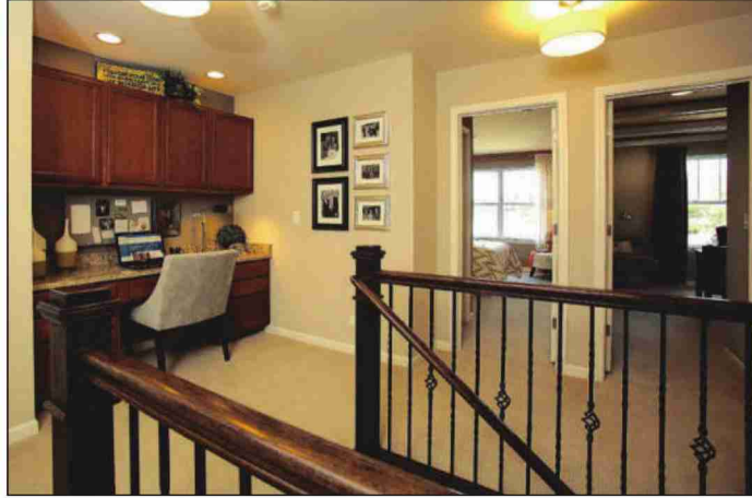
The second-floor loft niche is furnished with a built-in desk with upper cabinets, making a convenient workspace.