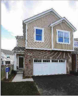
The Summit is one of three models at Lexington Hills.