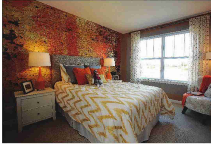
The second bedroom in the Summit model home is furnished for a daughter.