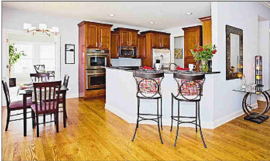
Rock Creek Builders at Henning Estates offers mid-priced homes on 1/3 acre homesites.