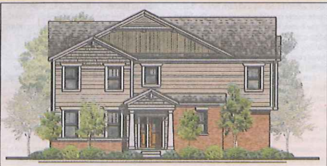
The luxury kitchen (left) at Wheaton 121 apartments is part of two decorated models open for viewing. A rendering (right) shows townhomes at Lexington Hills, one of two townhome developments coming to Palatine.