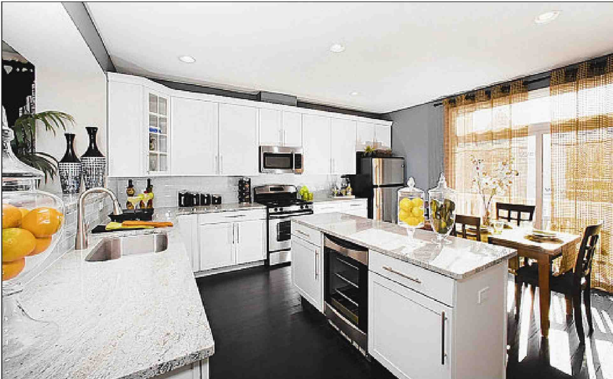
The kitchen at Lexington's Buckingham Square's model features white cabinets with crown molding, granite countertops, stainless steel appliances.

Submit your developer news to tmgcontent@tribune.com for advertorial consideration.