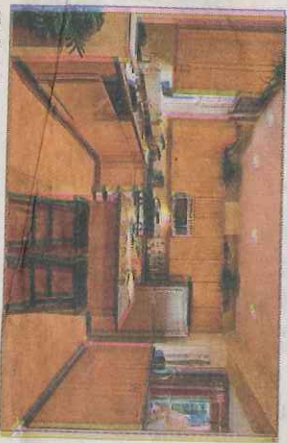
Kitchens feature granite counters, stainless steel appliances and wood floors.

Rob Roy feature the kind of high-end finishes that buyers expect in a home in this area, says Benach.